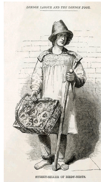
STREET-SELLER OF BIRDS'-NESTS.

One of the most profitable callings of the street-child is in the sale of Christmasing, but that is only for a very brief season; the most regular