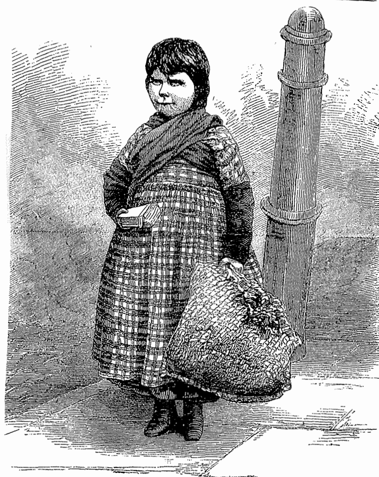
THE LUCIFER MATCH GIRL.