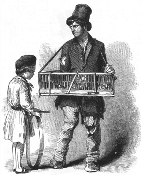
THE CRIPPLED STREET BIRD-SELLER. (From a Drawing by Beaman.)

Among the wares sold by the boys and girls of the streets are:—money-bags, lucifer-match boxes, leather straps, belts, firewood (common, and also "patent," that is, dipped into an inflammable composition), fly-papers, a variety of fruits, especially nuts, oranges, and apples; onions, radishes, water-cresses, cut flowers and lavender (mostly sold by girls), sweet-briar, India rubber, garters, and other little articles of the same material, including elastic rings to encircle rolls of paper-music, toys of the smaller kinds, cakes, steel pens and penholders with glass handles, exhibition medals and cards, gelatine cards, glass and other cheap seals, brass watch-guards, chains, and rings; small tin ware, nutmeg-graters, and other articles